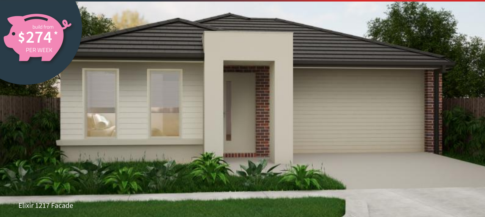
Elixir 1217 Facade

LOT 501 TRAFALGAR STREET , THE MILLSTONE , ROCKBANK