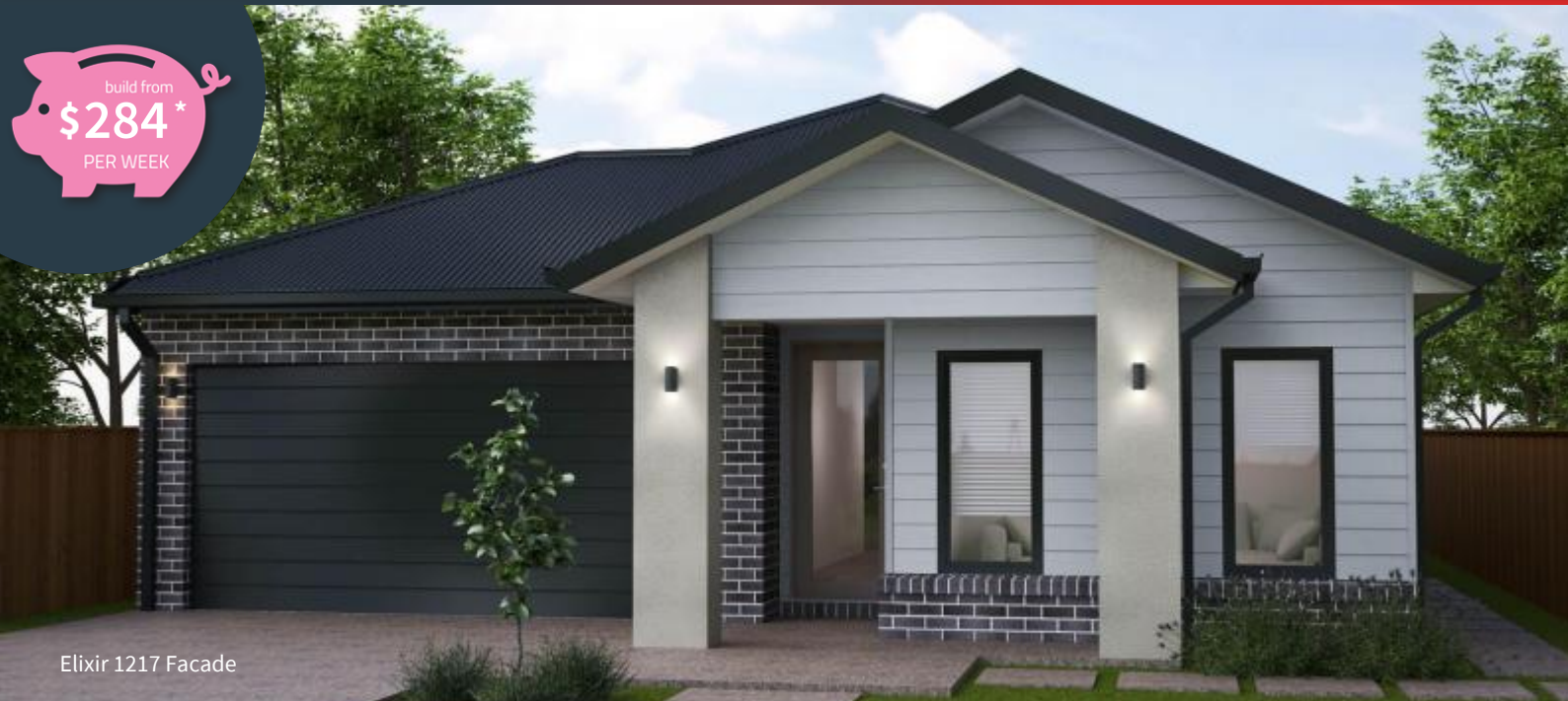
Elixir 1217 Facade

LOT 502 TRAFALGAR STREET, THE MILLSTONE, ROCKBANK