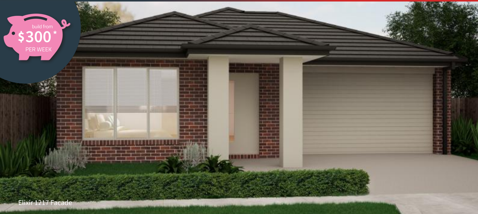
Elixir 1217 Facade

LOT 612 WESTBOURNE STREET , THE MILLSTONE , ROCKBANK