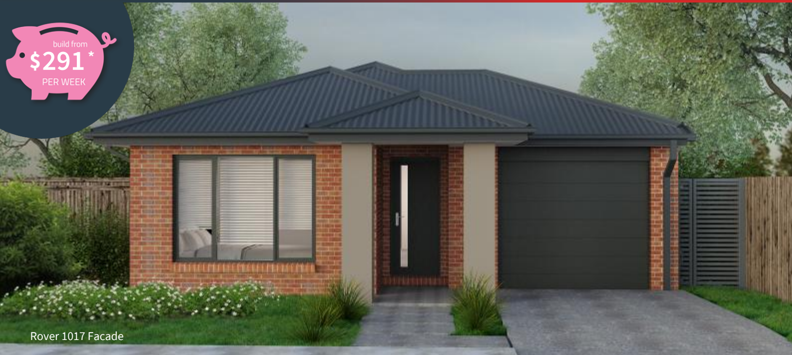
Rover 1017 Facade

LOT 628 SELBOURNE STREET , THE MILLSTONE , ROCKBANK