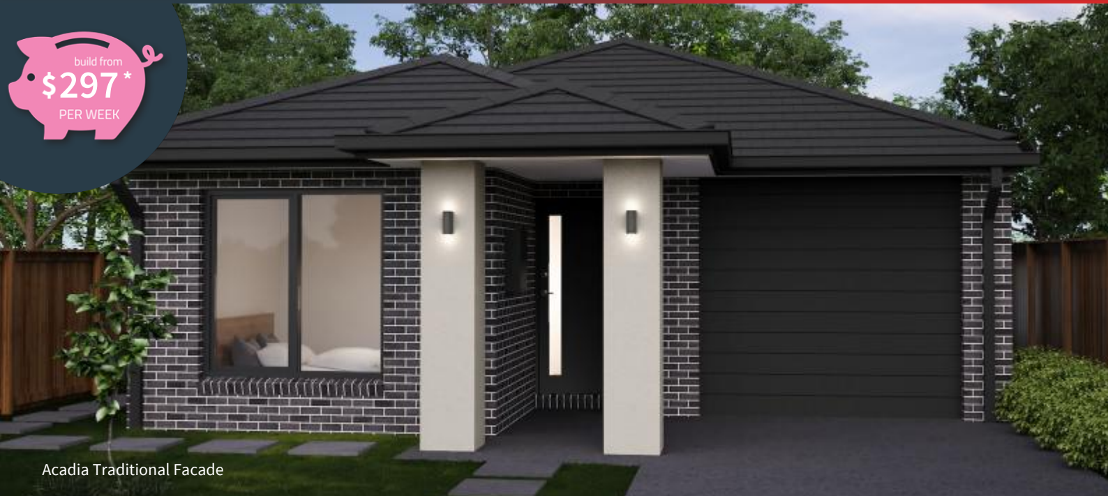
Acadia Traditional Facade

LOT 654 WESTBOURNE STREET , THE MILLSTONE , ROCKBANK