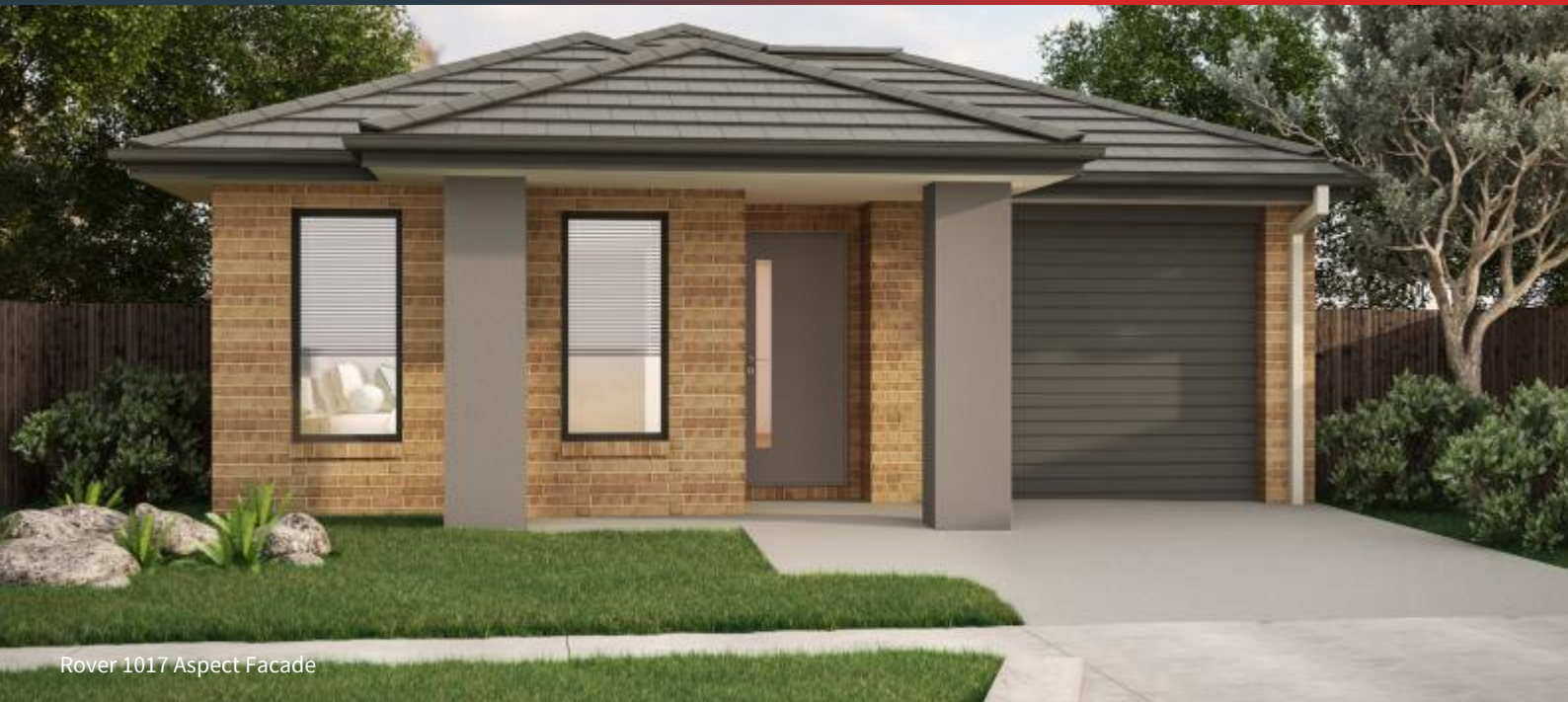
Rover 1017 Aspect Facade

LOT 647 WESTBOURNE STREET, THE MILLSTONE, STRATHTULLOH